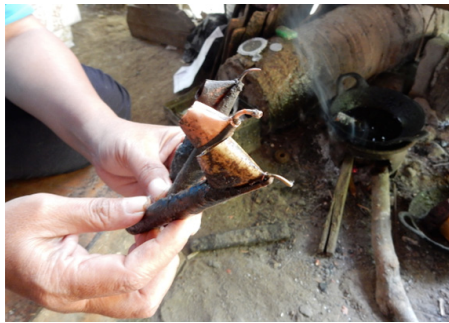
Figure 6 Canting

The Batik technique practiced in Wukirsari Village, which is called Batik Tulis, is a way to add wax to cloths by hand with the tool canting. Drawing on two sides of the cloths is also an ancient custom inherited till now. Women account for the majority of wax-drawing craftspeople as it was in the past. Wax-drawing, which is taken pattern selection and dying into consideration, includes the drawing of profile lines, the drawing of land patterns, wax-drawing on dye-free part and so on. Although some craftspeople can operate the whole process, division of labor is more often. About five craftspeople is needed to finish the entire operation.