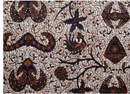
Figure 1 Woman drawing a pattern with wax on cloth Figure 2 Batik cloth