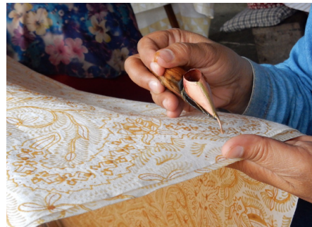
Figure 7 Wax-Drawing

Table 2 shows the results of a questionnaire survey about wax-drawing learning method answered by Batik craftspeople in Wukirsari Village. All of the respondents are females, who live in Wukirsari Village and work at those production organizations. The questionnaire response rate is 100%.