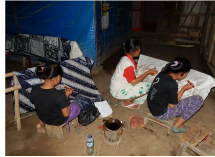
Figure 8 and 9 Mother and child drawing a pattern with wax on cloth