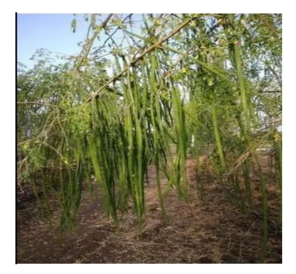
Fig. 1. Moringa peregrina

MP is an endangered species of desert tree that is growing in Saudi Arabia and Egypt [5]. The samples of Moringa leaves and seeds had a comparatively high mineral content, particularly calcium. Vitamins C and A are present in the leaves and seeds of MP, with a greater concentration of Vitamin C than A [6]. Patil et al. [7] found that Moringa leaves collected in the hotwet season had high levels of vitamin A, whereas leaves taken during the cool-dry season had high concentrations of iron and vitamin C. It has also been demonstrated that Moringa contains extremely low levels of anti-nutritional compounds, including oxalate, phytates, tannins, and oligosaccharides [7], this makes Moringa a very promising plant-based source of nutrition.