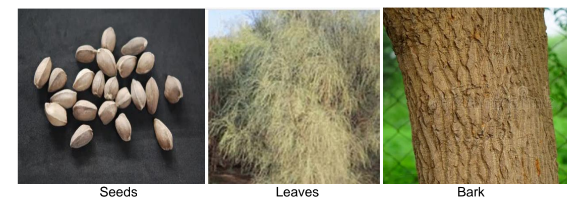
Fig. 2. Dry tree parts

According to Amaglo et al. [13], the material was dissolved in a solution of HNO<sub>3</sub> and HCl (1:1). After standing for 72 hours at 24°C, the mixture was filtered through a Millipore vacuum filter (0.45µm). Ultrapure water was used to dilute the filtrate 1:4. The method used for the analysis was ionic liquid chromatography. An electrolytic selfregenerating system, a conductivity detector, and a quaternary gradient pump were installed in the HPLC. Methane-sulfonic acid (25 mmol/L) was used as the elution solvent, with a flow rate of 1.0 ml/min. Analytical purity commercial solutions were used to create the standard dilution for the calibrations, which was then dried at 140 °C for four hours and re-suspended in 0.01 mol/L of each HNO3:HCI (1:1). Mineral levels were expressed as milligrams per kilogram of dry plant matter.