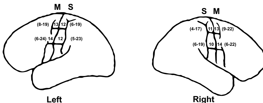
FIGURE 2 | Widths of pre- and postcentral gyri (mm) in left and right hemispheres from 25 human cadavers. Mean widths and ranges are summarized from Ono et al. (1990, pp. 152–153). S , primary somatosensory cortex; M , motor cortex. As illustrated, the range for the medial measurement for the right M is 9–22 mm rather than 9–12 mm, which is a typo in Ono et al.

My identification of the level at which aSyl and pti meet in Einstein's right hemisphere [at the white dot labeled S (the caudal termination of the Sylvian fissure) in Figure 1C ] is noticeably lower than Witelson et al.'s (1999b, indicated by arrow in Figure 1C ). It is not clear when or by whom the arrows were placed on Witelson et al.'s photographs, or what methods were used to determine the terminal points of the Sylvian fissures. Ideally, one would determine the point ( S ) of confluence of aSyl and pti by examining their submerged morphology (Connolly, 1950; Steinmetz et al., 1990). Einstein's gross brain is no longer available, however, and there is no indication that the relevant blocks/sections were analyzed for submerged sulcal patterns. My location for right S is based on a number of observations: In lateral view, the sulcus at this level appears relatively wide compared to the medially located and slightly arched pti that merges with it, similar to Einstein's left hemisphere ( Figures 1B,C ). These locations result in lengths and positions of pts and pti that are relatively balanced in the two hemispheres ( Figure 1 ), and yield an aSyl