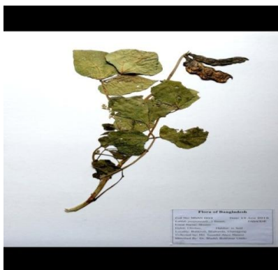
Image 2. Herbarium of Lablab purpureus