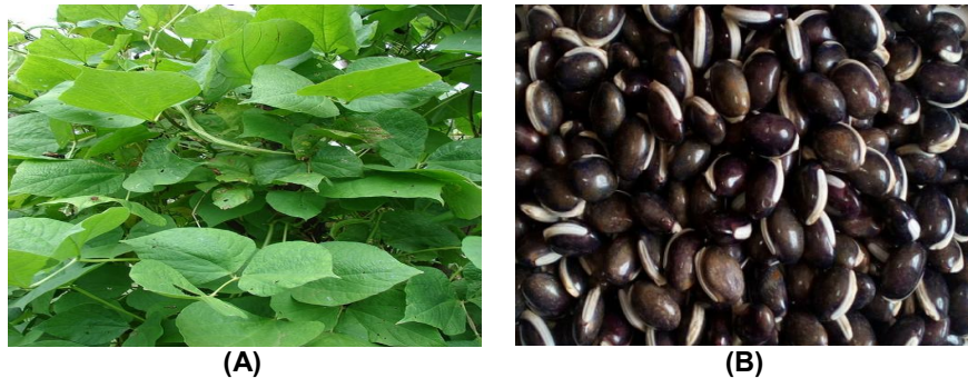
Image 1. Morphology of Lablab purpureus (A) Whole plant; (B) Seeds

Values are mean±SEM., (n=5); * p<0.05 , ** p<0.01 , *** p<0.001 , Dunnet test as compared to control (vehicle=10 ml/kg)