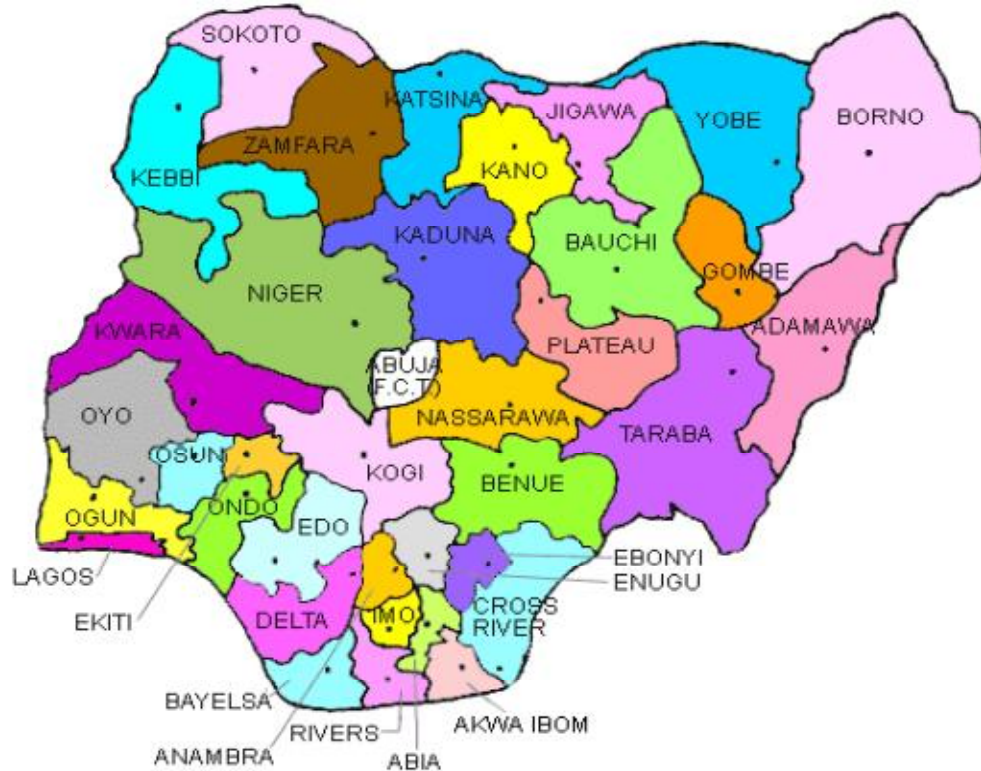
Fig. 1. Map of Nigeria showing the various states, [10]

confronting practically every state of the country [4]. Hence, there is need to put proactive measures in place towards managing waste in order to achieve economic, social and environmental protection [4]. In addition, energy generation, resource and material recovery from waste through improved MSW management is desirable [9].