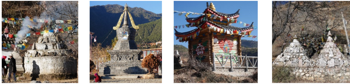
Figure 2. Mani Lumps (Photos by Wei Yu, January 2017)