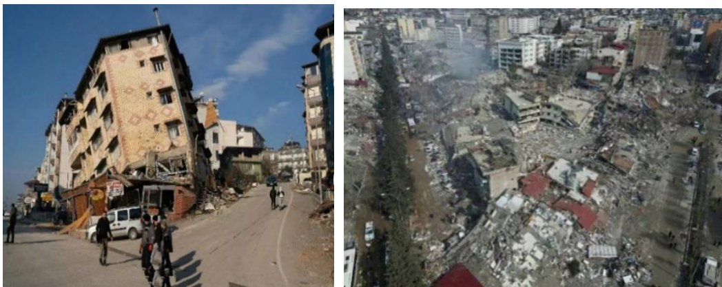
Fig. 1. Earthquake damage

In recent years, there is a new type of combined structure that is filled with concrete between the two flanges of H-beam and become a new type of partially wrapped concrete combination of components called partially encapsulated steel-concrete combination of structures referred to as PEC, as shown in Fig. 1. The concrete between the flanges of the PEC components can bear a