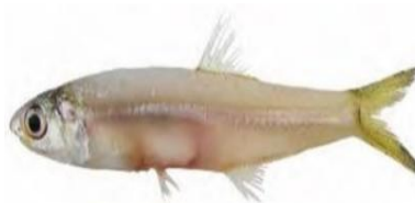
Fig. 2. Stolephorus sp.

Phylum: Chordata Class: Pisces Order: Malacopterygii Family: Clupeidae Genus: Stolephorus Species: Stolephorus sp.