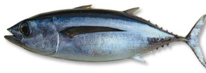
Fig. 5. Thunnus alalunga

Phylum: Chordata Class: Teleostei Ordo: Perciformes Family: Scombridae Genus: Thunnus Species: Thunnus alalunga