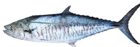
Fig. 4. Scomberomorus commerson

Phylum: Chordata Class: Actunopterygi Ordo: Perciformes Family: Scombridae Genus: Scomberomorus Species: Scomberomorus commerson