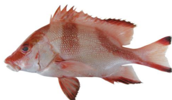
Fig. 1. Latjanus sabae

Phylum: Chordata Class: Pisces Order: Percomorphi Family: Lutjanidae Genus: Lutjanus Species: Latjanus sabae