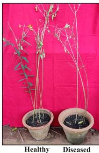
Fig. 1. Pathogenicity study of F.udum on sunhemp

micro and macro conidia and chlamydo spores varied among of the different solid media used. The micro conidial size was lowest in Czapeck's dox agar which ranged from 7.16 -11.34 × 3.70 - 4.75 µm with average size of 9.72×4.19 µm and the micro conidial maximum size was observed in Sabouraud's dextrose agar which measured 13.44-15.86 × 3.34-3.63 µm with the average size of 14.58×3.48 µm with zero to single septation. Whereas, the macro conidial size was found highest in Richard's agar which measured 31.02-36.62 × 4.24 - 4.85 µm with average size 33.46 × 4.59 µm and least size was observed in corn meal agar which measured 22.70-31.02 × 4.14-4.66 µm having average size of 26.11×4.38 µm with 2 to 4 septation. The chlamydo spore diameter was highest in potato dextrose agar which ranged from 6.58 to 7.41 µm with average of 6.99 µm whereas the lowest was in potato carrot agar which measured 5.65- 6.48 µm with a mean of 6.04 µm diameter (Table 2).