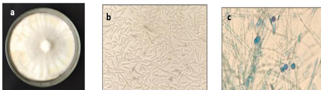
Fig. 2. a) Pure culture of F.udum on PDA after 2 days of incubation b) Macroconidia and microconidia (400X) c) Chlamydo spores (400x)