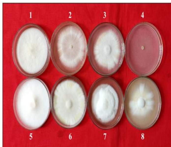
Fig. 3. Morphological characteristics of F. udum on different growth media 1-V8 Juice agar, 2-Potato dextrose agar, 3-Potato carrot agar, 4-Corn meal agar, 5-Richard's agar, 6-Sabouraud's dextrose agar, 7-Czapeck's dox agar and 8-Oat meal agar