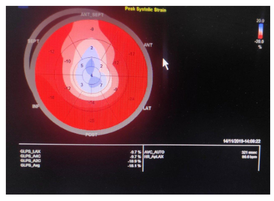
Fig. 2. Global longitudinal strain in Takotsubo cardiomyopat