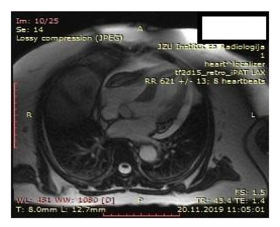
Fig. 3. Magnetic resonance of the heart in Takotsubo cardiomyopathy

Otljanska et al.; JAMMR, 32(13): 1-6, 2020; Article no.JAMMR.59382