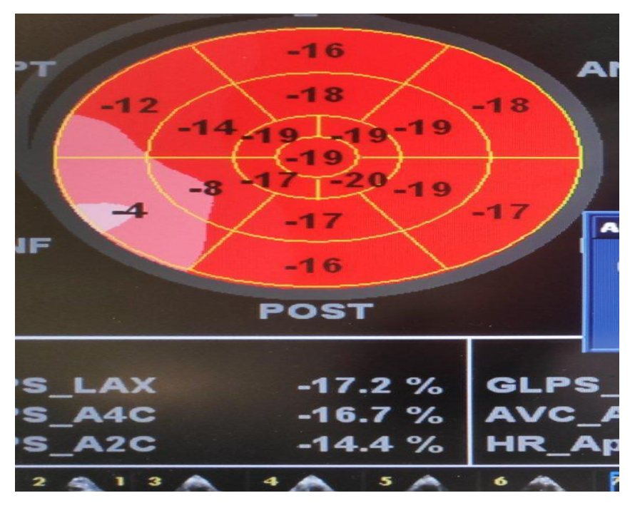
Fig. 5. Global longitudinal strain after 2 months

Otljanska et al.; JAMMR, 32(13): 1-6, 2020; Article no.JAMMR.59382