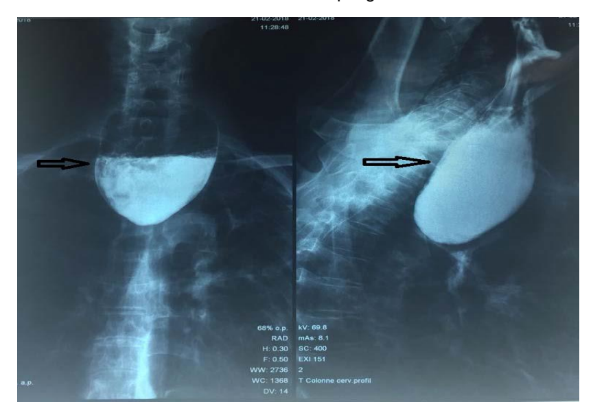
Fig. 3. Huge diverticulum of the cervical esophagus

pallor, no history of fever. patient had experienced a 15 kg weight loss for last two months. The endoscopic examination revealed a huge intra luminal pouch in the esophagus preventing the endoscope to progress further in the digestive tractus. Therefor the examination was supplemented by a barium radiography (Fig. 3) and a CT scan which showed a Huge diverticulum of the cervical esophagus.