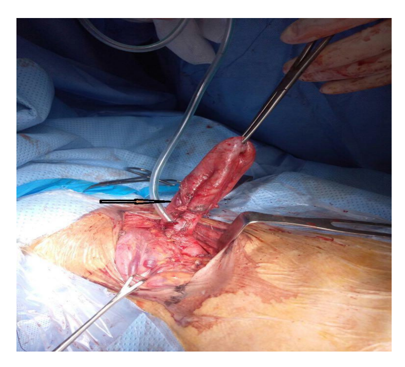
Fig. 4. Intraoperative image of diverticulum

The operation was performed under general anesthesia in the supine position. A cervicotomy along the internal edge of the left sterno-cleidomastoid muscle was made, resection of the left thyroid lobe to access the esophageal compartment, release of the diverticulum (Fig. 4), opening of the bag to reassure the passage of the nasal tube, resection of the diverticulum with 75mm linear stapler.wound closed.