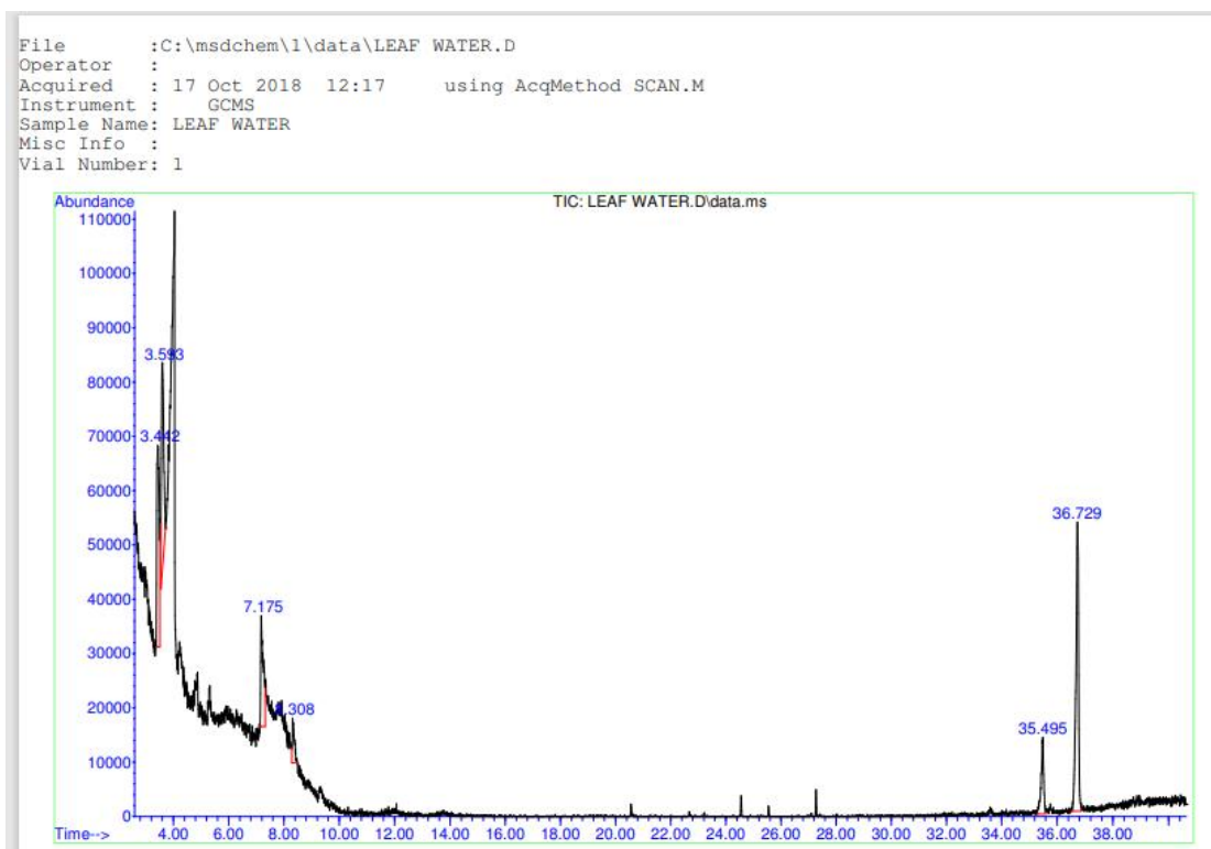
Fig. 1. Graph of gas chromatography-mass spectrometry analysis of aqueous leaf extracts of Morus mesozygia Linn.S

The results revealed 'Twenty-two (22) chemical components from the Methanolic leaf extracts having the highest numbers of chemical components from which the top five with the highest percentage of components identified included: 4-Methyl-1-3-(3-Nitrophenyl)- 6-Phenyl (24.8%), 3(2H)-Pyridazinone-6-Methyl (11.45%), 3,7,11,15-Tetramethyl-2-Hexadecen-1-ol also known as Phytol (9.1%), 9,12,15-Octadecatrienoic