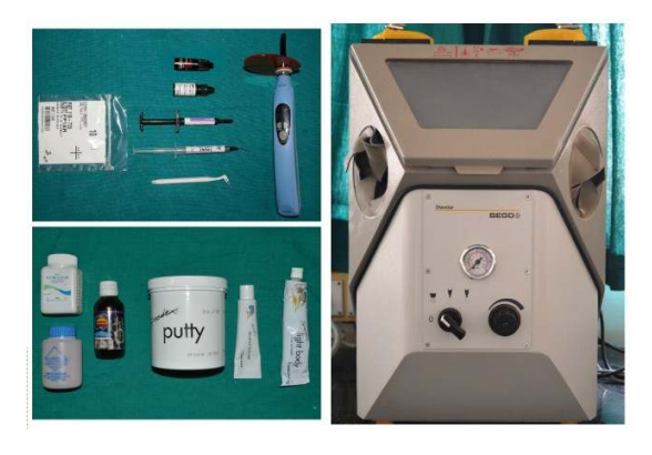
Fig. 1. Materials used in the study

The ARI scores were used to assess the sites of bond failure on the enamel-adhesive interface and the adhesive-bracket interface. The enamel fractures after debonding are assessed with the stereomicroscope at a magnification power of 10x.