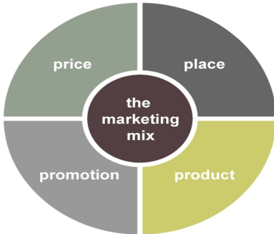
Fig. 1. Marketing mix – 4P

This includes the traditional thought on marketing, the new challenge of marketing activities in the Web 2.0 or of customer relationship management and the fact that new marketing approaches are characterized by exceeding designing and inter active communication. 360° Marketing is the marketing, which integrates different marketing options for an effective marketing. 360° Marketing connects the marketing activities of an enterprises with the marketing options that emerge as a result of the markets, the customer sand through the new media. 360° Marketing helps the marketing experts to manage the balance in the use of different media. 360° Marketing open the horizon to numerous media and leads the marketing expert in the marketing world of tomorrow through a new attitude and practical approach. Principle of all round-view 360°. Marketing motivates the marketing expert to have an integrated view of new possibilities of marketing with digital media based on the traditional marketing activities [3].